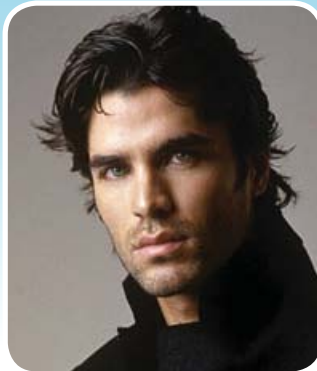
Edwardo Verastegui Mexican model, actor, singer, and humanitarian